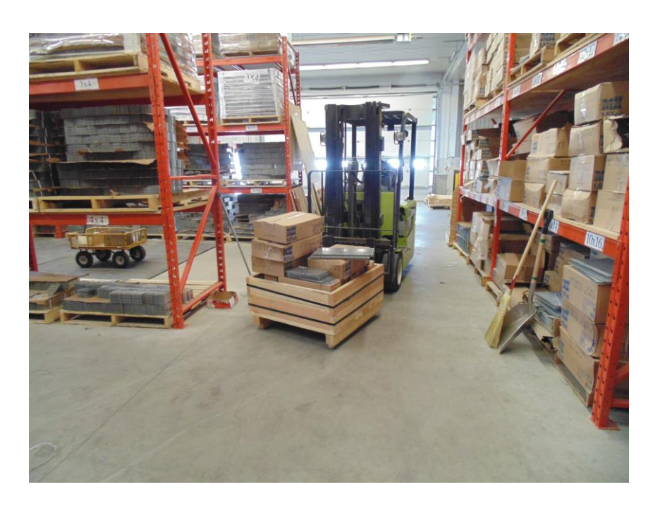
Good inside plate storage

In our Alberta Q.C. audit instrument we have a question worth 10 points that asks that the auditor should observe how metal plates are stored and note if there is any exposure to elements that can affect the plates. The auditor may award a range of the total points allowable based on their observation. If the auditor observes red-rusted plates on finished trusses, no points can be awarded. (Note: White patches on plates indicate zinc oxide which will not reduce plate capacity.)