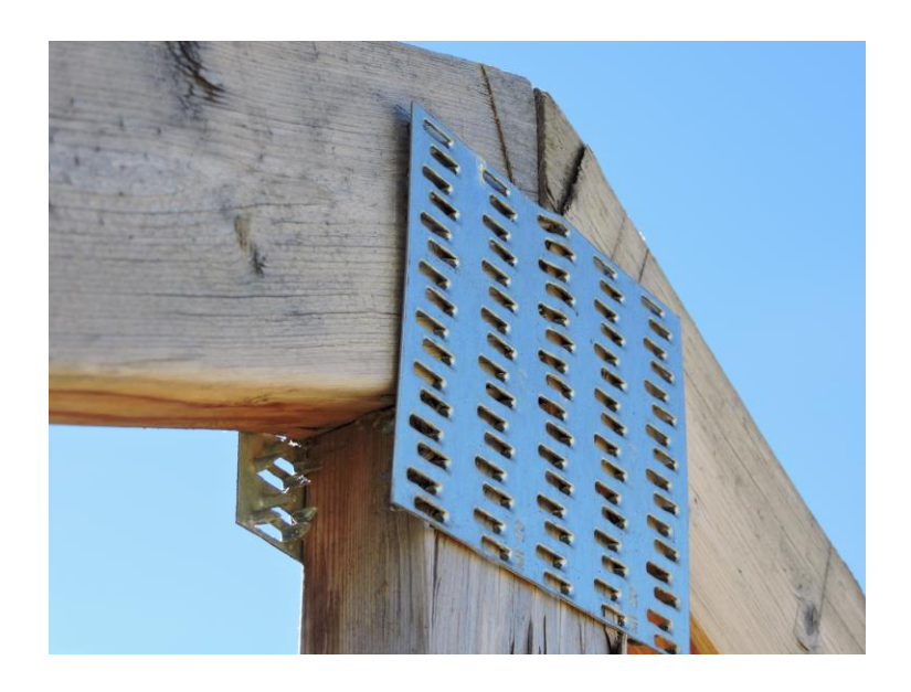
Plates exposed to weather withdrawing but showing no signs of rust

Generally, the galvanizing does a pretty good job inhibiting rust, and most of the instances I have seen with rusting plates are the result of them being exposed to corrosive elements or instances of high humidity.